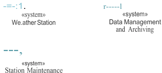
Figure 1.7 The weather station's environment

system. Some mental illnesses cause patients to become suicidal or a danger to other people. Wherever possible, the system should warn medical staff about potentially suicidal or dangerous patients.